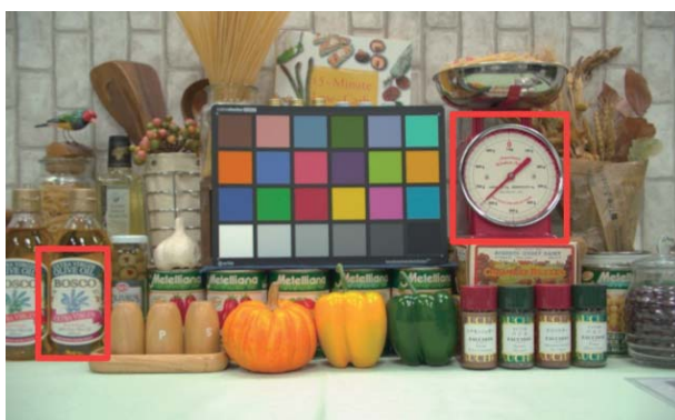
ROI mode (Cropping areas)

Condition: 2000 lx F5.6 (UXGA image ADC 12 bit mode, 60 frame/s, internal gain 0 dB)