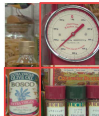
ROI mode (After cropped)